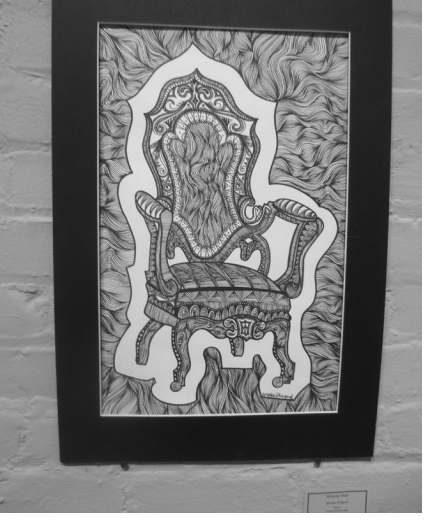
Brooke Steigauf's drawing

Carlos Torres: pencil self-portrait Brooke Steigauf: ink line drawing Tony Reamer: landscape photo