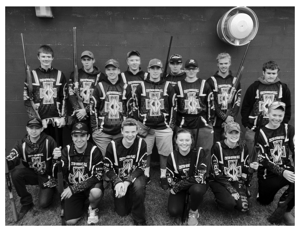
The 2014 Trap Shooting Team at the State Championships last year.

The only prerequisite for season participation is that each athlete must possess his/her Hunter and Safety Education Certificate offered by the state before they can compete. School letters are awarded to those