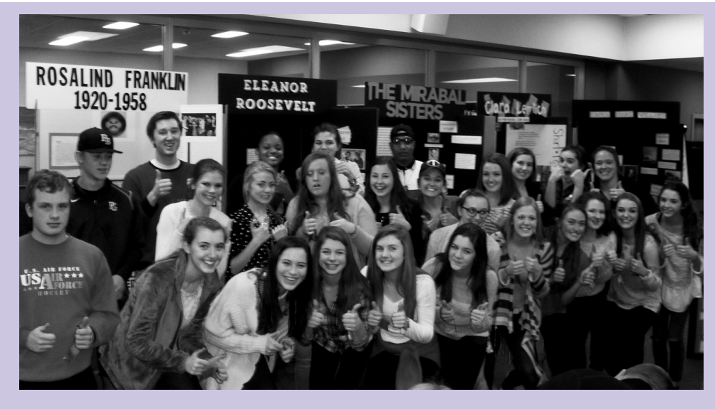
Students who represented CDH at East Metro Regional History Day participants gathered for a photo in the LLC where their projects were on display at the awards dinner.