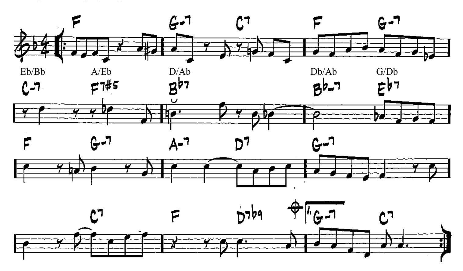
Part 3 Group Audition Please come to the group part of this audition. Be ready to sight-read tunes in a group setting.

Melody in a Swing Style- quarter note= 130-150